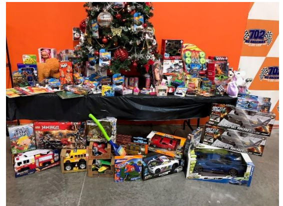
Donation from 702 Raceway

December was a whirlwind of activity in District B. We set out to bring the joy and spirit of the season to as many folks as we could. We cooked holiday meals, decorated cookies, and helped Santa hand out gifts to children at apartment complexes, schools, the Autism Community and Nellis Air Force Base. Of course we didn't do this alone, we have amazing community partners and the outstanding employees of Clark County.